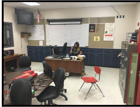
Some of the new players!