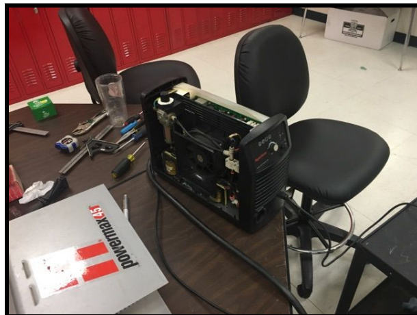
The broken Plasma Torch.

Please be sure to give us a 'like' on our Facebook page @Cub_Manufacturing