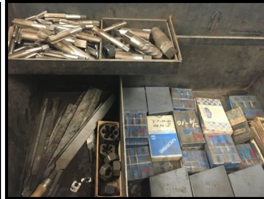
Some of the toolboxes with tools.